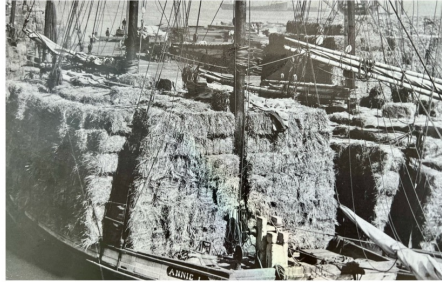
Historic Scow Schooners from Gold Rush Era